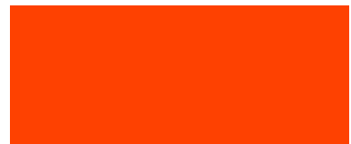
24. Reinorange RAL 2004