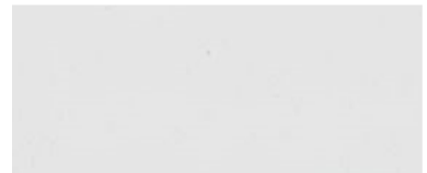
75 – Lichtgrau RAL 7035