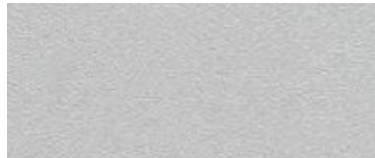
96. Alusilber RAL 9006